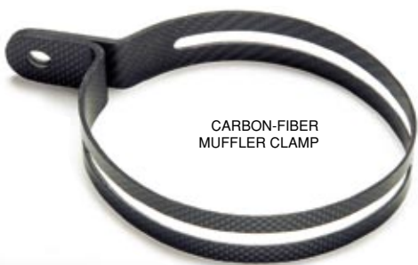
CARBON-FIBER MUFFLER CLAMP