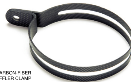
CARBON-FIBER MUFFLER CLAMP

Product code: 104239 (S-S10SO2T-C) 104240 (S-S10SO2T-T)