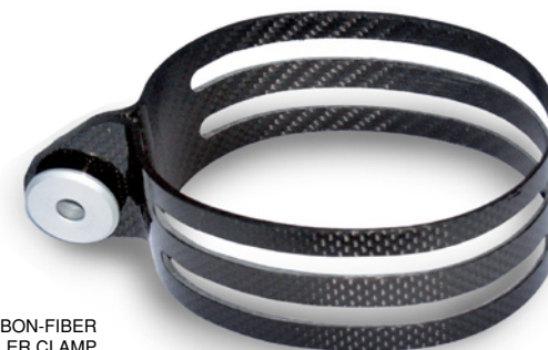
CARBON-FIBER MUFFLER CLAMP

Product code: 105587 (S-B12SO2-LTC) 105546 (S-B12SO2-LTT)