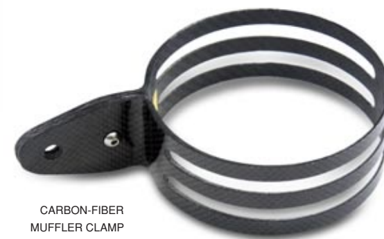
CARBON-FIBER MUFFLER CLAMP